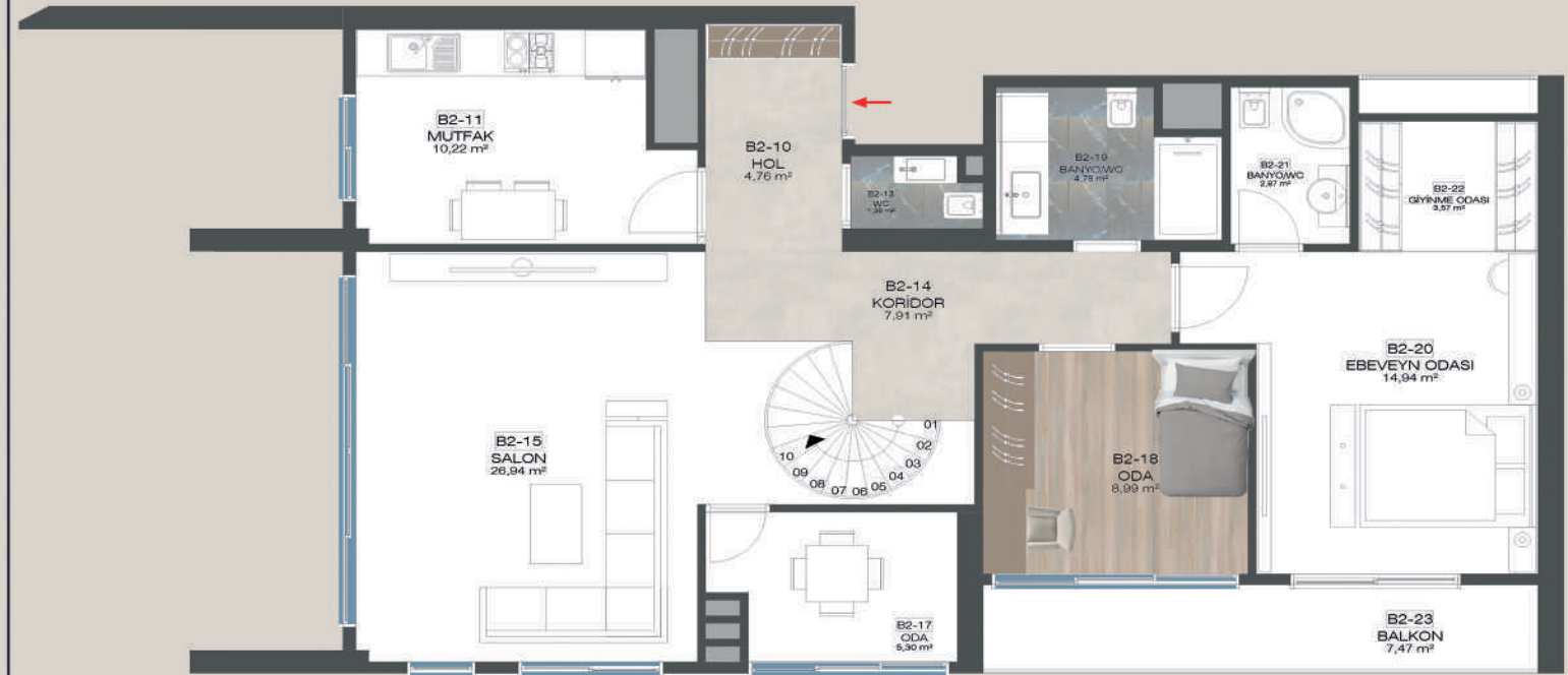
1. BASEMENT FLOOR PLAN